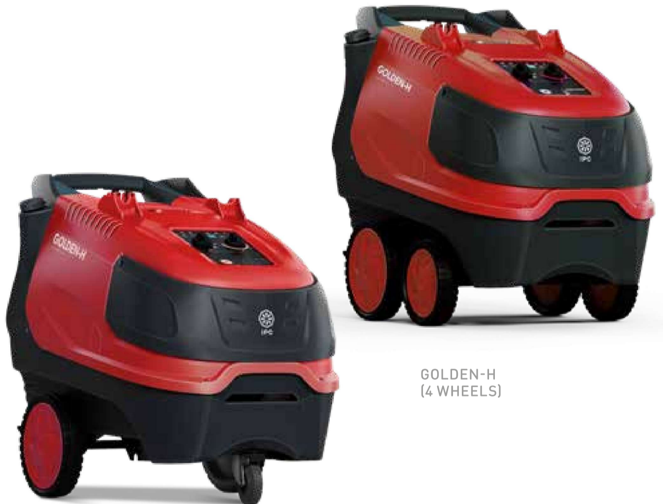
GOLDEN-H (3 WHEELS)