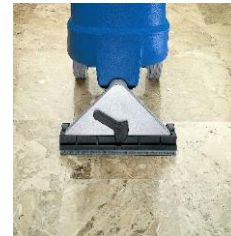
Hard floor cleaning