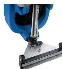
quick disconnect nozzle